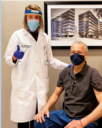
During the pandemic, West Suburban staff not only cared for patients with COVID-19, but also administered more than 1,200 COVID-19 vaccinations to community members.

And, it is with great pride that I present this Community Impact Report detailing the most recent accomplishments of this hospital in serving its community. I also wish to express gratitude to the Illinois legislators who have supported our hospital in meaningful ways.